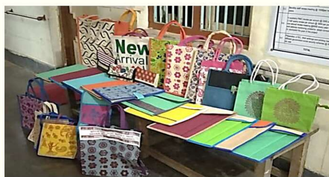
Jute Bag prepared by SAMARTH members