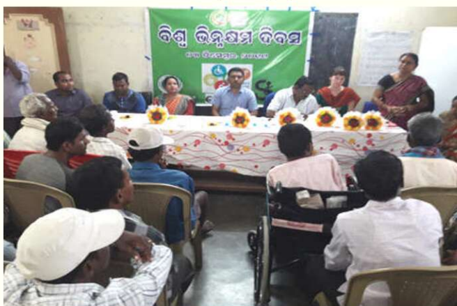
Observation of World Disable Day