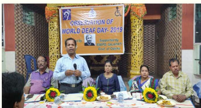
Observation of World DEAF Day