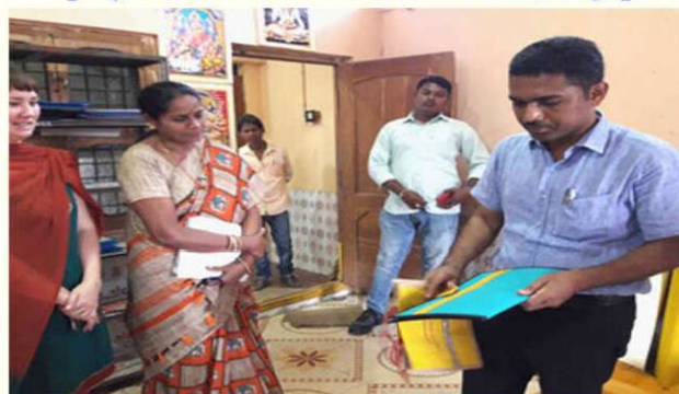
Collector, Gajapati has visited Jute bag unit promoted by SAMARTH, Gajapati