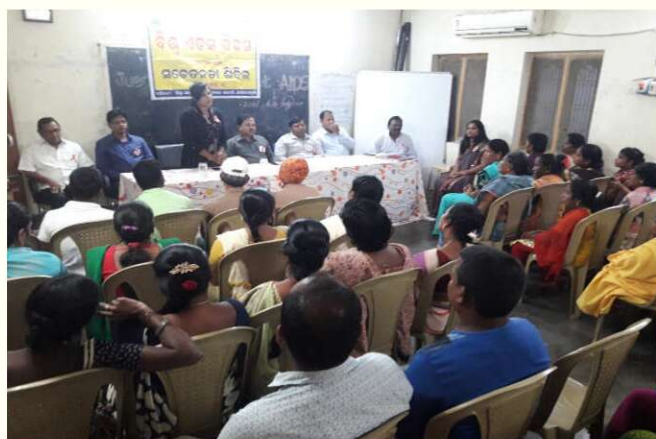
Observation of World AIDs Day